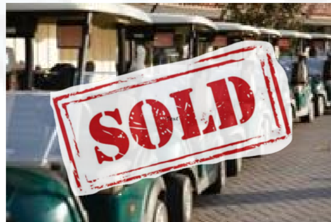
Golf Cart Sponsor $7,500 One (1) Available