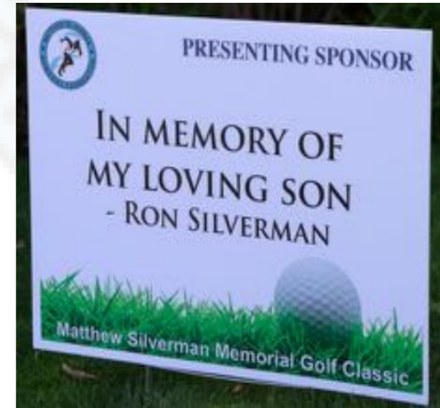
Sign Sponsor $7,500 One (1) Available