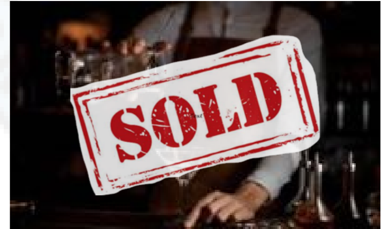
Hosted Bar Sponsor $5,500 One (1) Available