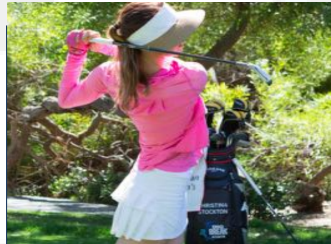
Contest Sponsor $2,750 One (1) Sold, Five (5) Available