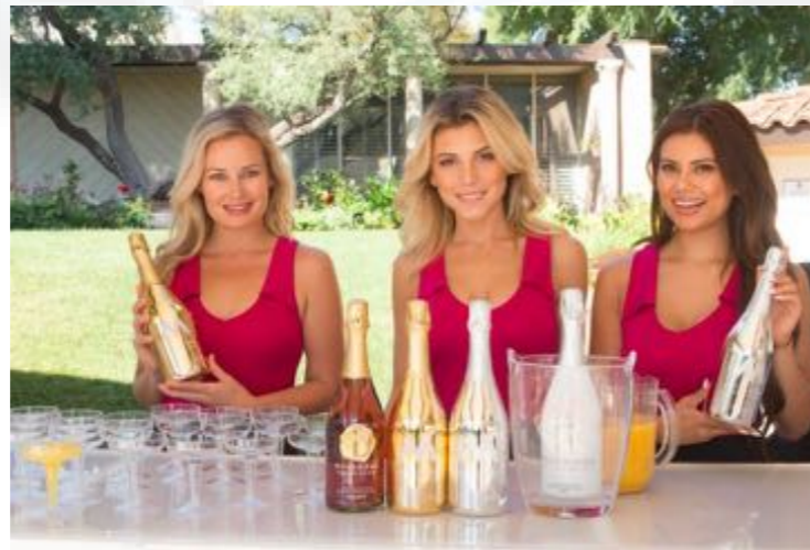
Beverage Sponsor $2,750 Four (4) Available