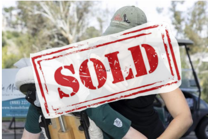
Relaxation Station $7,500 One (1) Available