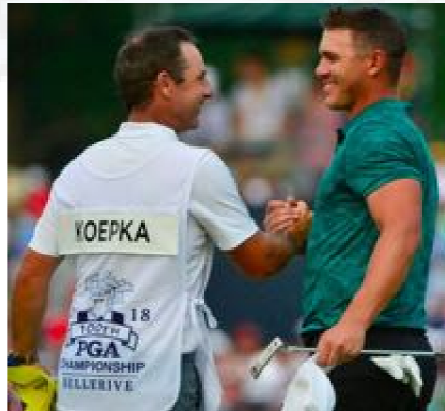
Caddy Sponsor $10,000 One (1) Available