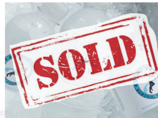
Water Sponsor $7,500 One (1) Available