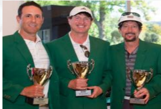
Awards Sponsor $7,500 One (1) Available