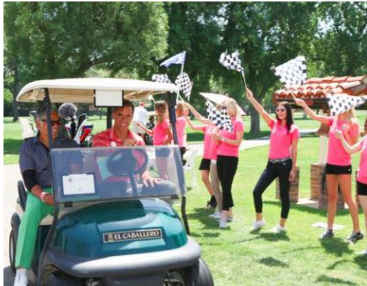
Morning Tee Off Sponsor $10,000 One (1) Available