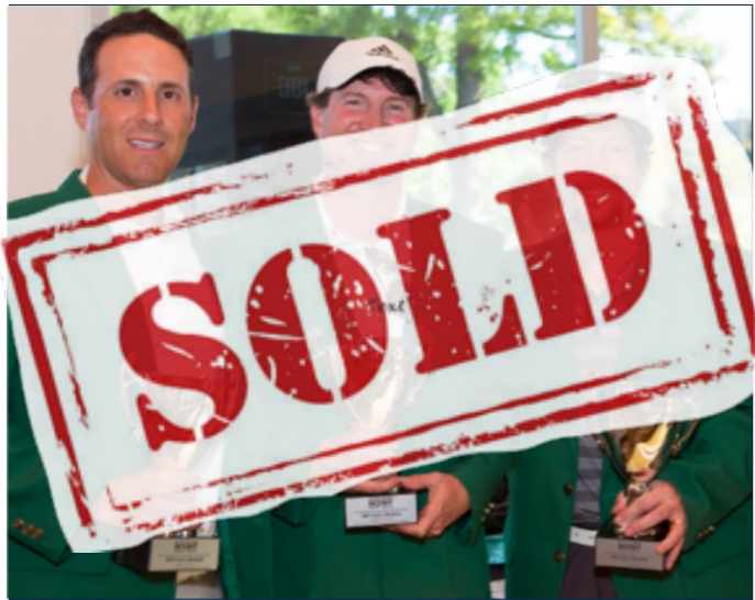
Awards Sponsor $7,500 One (1) Available