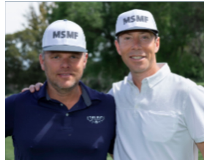
Duo Sponsor $3,000 (twosome)