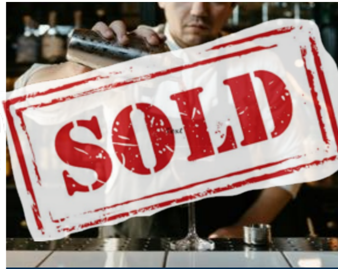
Hosted Bar Sponsor $7,500 One (1) Available