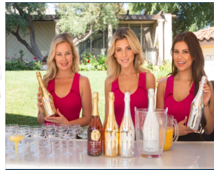
Beverage Sponsor $3,750 Four (4) Available