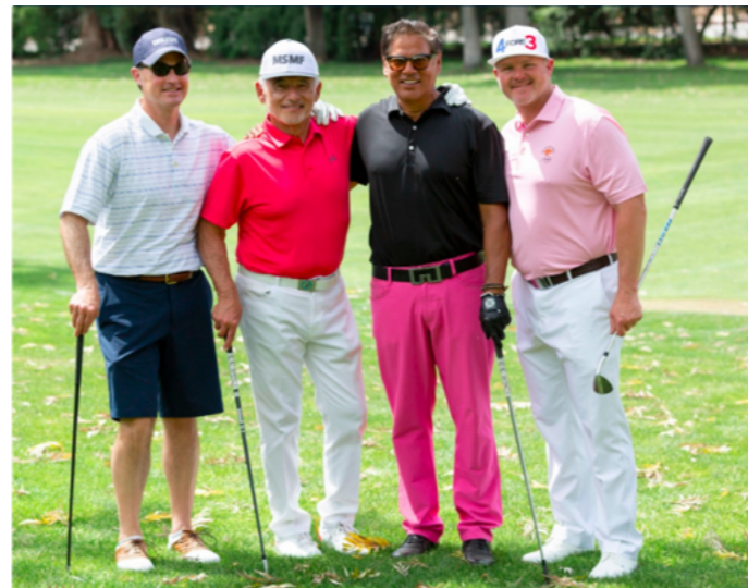
Executive Sponsor $6,000 (foursome)